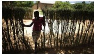
THE TAKEAWAY One Rwandan Genocide Survivor's Quest to Support Other Refugees