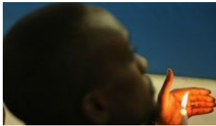
ON THE MEDIA 100 Days in Rwanda