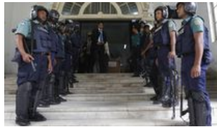
WNYC NEWS Sentenced to Death in Bangladesh, a War Criminal Remains Free in New York