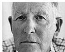
'Warren Buffett Indicator' Signals Collapse in Stock Market Moneynews