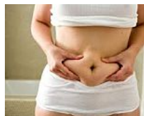
Discover A 30 Second Daily "Trick" That Shrinks Your Belly Health First