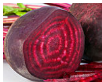
Do-it-yourself Free Testosterone Solution Better By The Minute